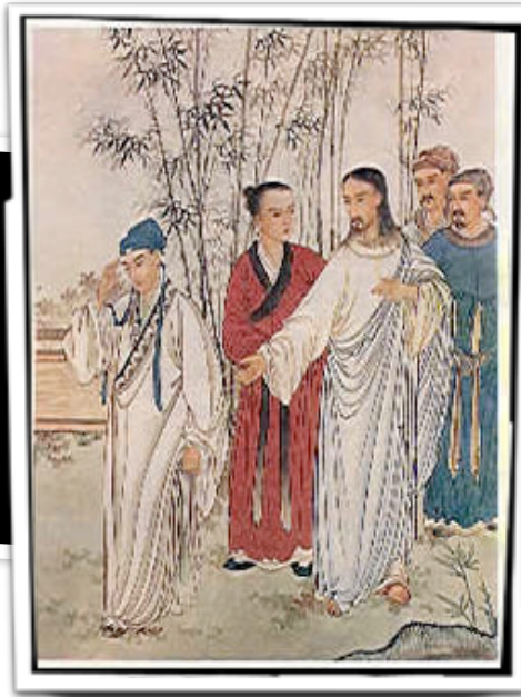
Chinese depiction of Jesus and the rich young man , Beijing , 1879.

Can you drink the cup I drink? Mark 10:38