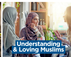
Understanding & Loving Muslims