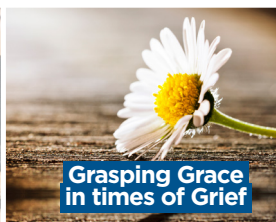
Grasping Grace in times of Grief