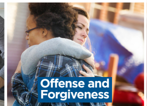
Offense and Forgiveness

Classes Begin September 15. Pick up a booklet at the Welcome Desk.