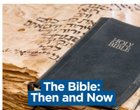
The Bible: Then and Now