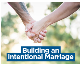
Building an Intentional Marriage