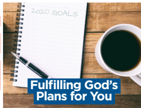
Fulfilling God's Plans for You